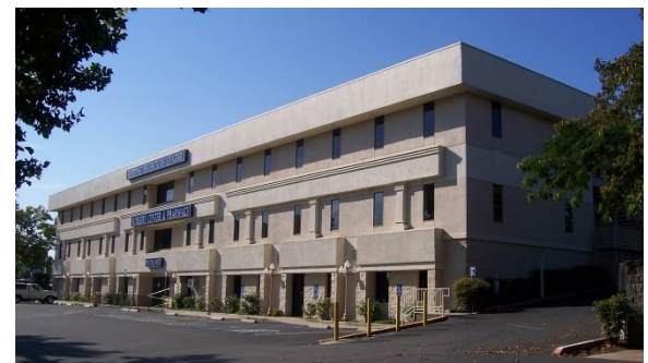
Redding Rancheria Health Clinic Redding, CA