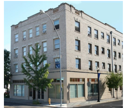
Housing Authority of Jackson County-Grand Hotel, Medford