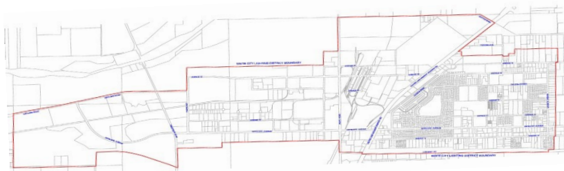
White City Lighting Project Boundary

"Nice work with the estimates. The Owner was very happy with the results."